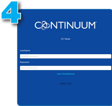
Login to the tablet using your credentials