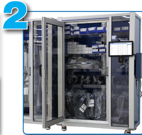
Select the prescribed product